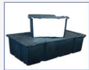
Foam filled heavy duty floats