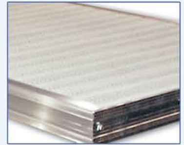
No pipes protruding through decking