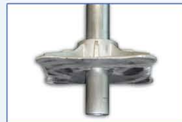
Lake bottom anchoring system