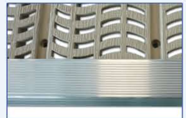
2" traction strip

Warranty info: The dock frame has a 10 year prorated warranty. The DeckWave® decking has a 15 year prorated warranty. The warranty does not cover against acts of God or misuse of product. Wave Legend: Each wave symbol indicates one foot of wave height.