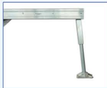
7 degree angle legs