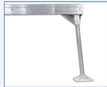
5 degree angle legs