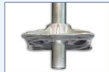
Lake bottom anchoring system