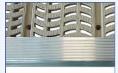
2" traction strip