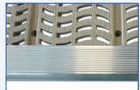
2" traction strip