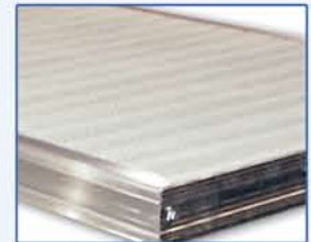
No pipes protruding through