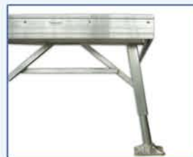
9 degree angle legs