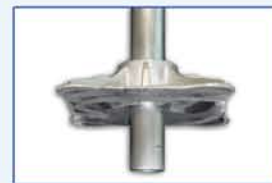
Lake bottom anchoring system