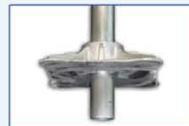
Lake bottom anchoring system