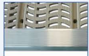
2" traction strip